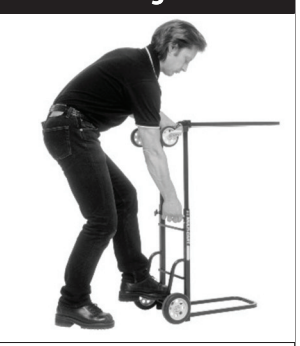
Loosen wingbolts 1/4 turn. Step on rear axle and push in extension stop button. Pull up on frame as shown until stop button engages. Retighten wingbolts.