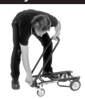
Firmly press down on release cable while raising other end of foldable side as shown.