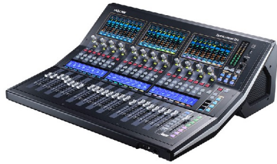
TASCAM Sonicview 24