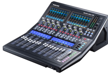
TASCAM Sonicview 16