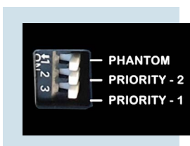
Priority and Phantom Power